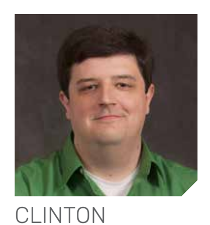
WIEDEN Undergraduate Academic Advisor